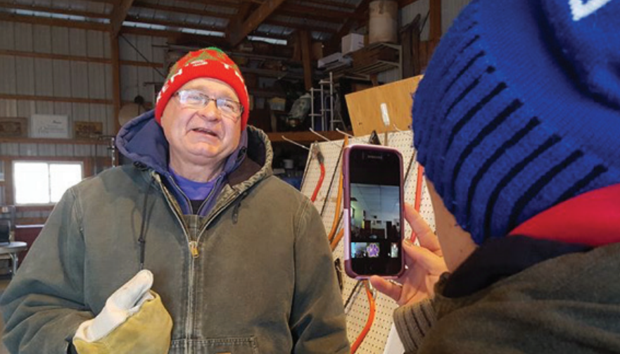
2017 Grant Recipient Grundy County Farm Chat Grundy County ISU Extension & Outreach