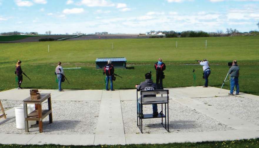
2017 Grant Recipient Team iPad Turkey Valley Trap Shooting Team