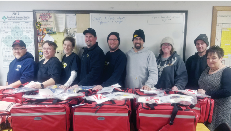
2017 Grant Recipient Basic Life Support (BLS) Jump Kits Readlyn EMS