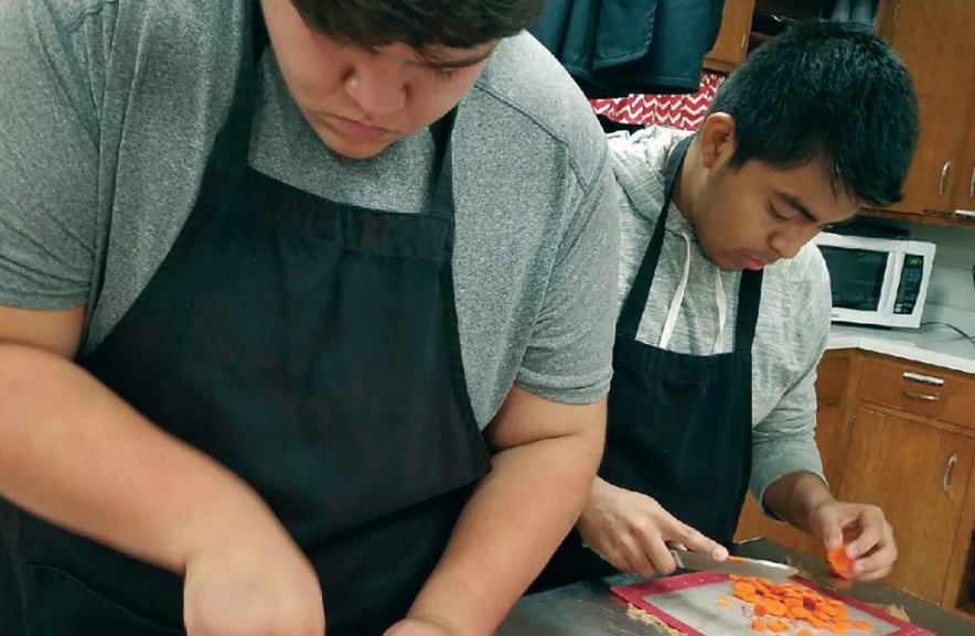
2016 Grant Recipient Northern Iowa River Greenbelt 2016 Taste of Franklin County