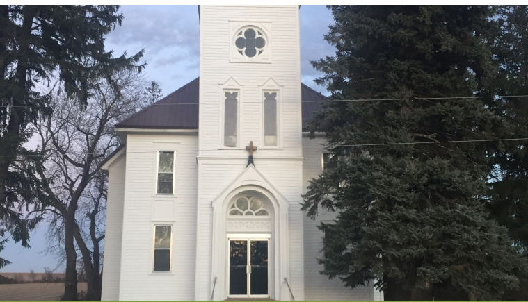
2018 Grant Recipient Friends of St. Patrick's Chapel, Inc. Church Painting Project

Elma Area Community Foundation grants provide essential funding to nonprofits and government entities serving the Elma Area and its residents. Since 2005, we have granted over $101,034 to support our partners in making our communities better places for all people.